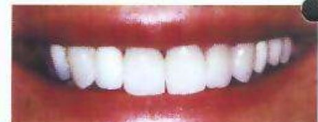
After SYNERGY® Super White veneer